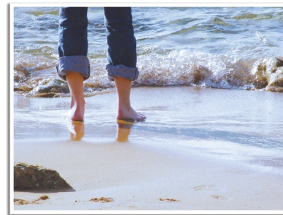
"Be still and know that I am God." —Psalm 46:10

WHERE WOMEN BASK IN GOD'S PRESENCE Longing for time to slow down, wiggle your toes in the sand, and bask in the warmth of God's presence? Join us at SeaSide Escape. It's a beach-themed retreat where you'll experience meaningful Bible study and worship, connect with other women, and have time for quiet reflection and plenty of laughter.