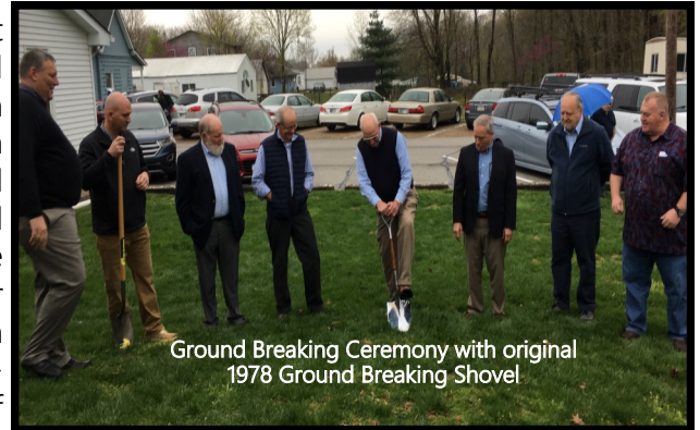
Ground Breaking Ceremony with original 1978 Ground Breaking Shovel

It was a joyous moment on Sunday morning, April 14 (Palm Sunday), when worshippers from both morning services united for an exciting ground breaking ceremony in the grassy square where our new entry way addition will sit. Our church elders, trustees, and staff were joined by others in turning over a clump of dirt in anticipation of construction. A gentle reminder: Please exercise much caution and patience in the many months of construction that are to come. Thank you and to God be all the glory!